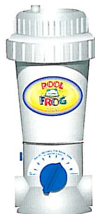
POOL FROG® IN GROUND CYCLOR