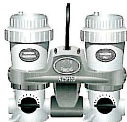
POOL FROG® XL PRO In Ground System with Ex-tended Pac Life