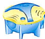
INSTANT FROG® Mineral Sanitizer for In Ground Skimmers