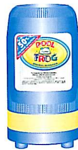
POOL FROG® MINERAL RESERVOIR

• The POOL FROG® system is three parts in one. First , the POOL FROG® Cyclor serves as a "water treatment center" and controls the flow of water. Second , the POOL FROG® Mineral Reservoir, the essential part of the system, is placed inside the POOL FROG® Cyclor and holds one season's worth of minerals. Third , a POOL FROG® Bac Pac is placed inside the POOL FROG® Mineral Reservoir, providing low level chlorine support.