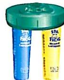
SPA FROG® Floating System Floats in Any Spa