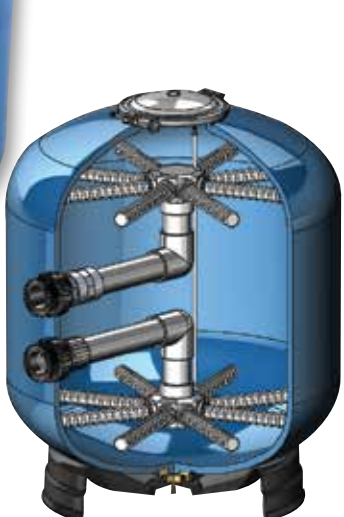
OC-1 Domestic Filter