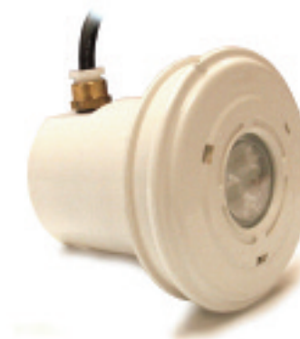
PLSC300C (Multicoloured) PLSW300S (white)