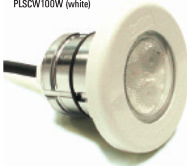
PLSC100W (Multicoloured) PLSCW100W (white)