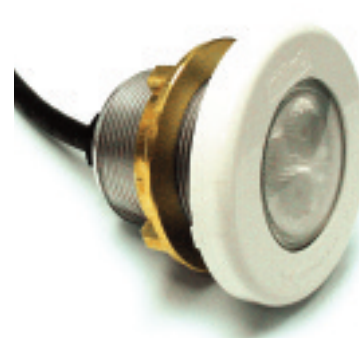
PLSC200S(Multicoloured) PLSW200S (white)